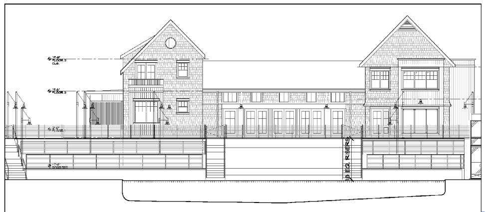
Architectural drawing of the poolside elevation of the new clubhouse